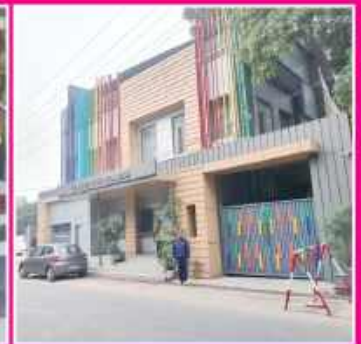
THEN & NOW